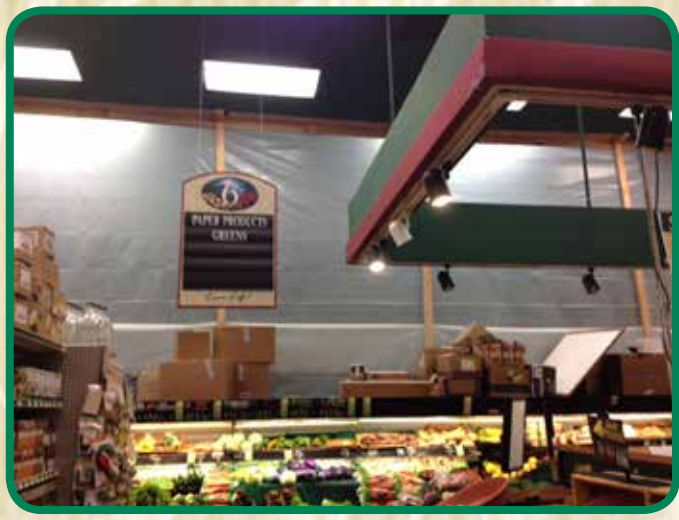
The back wall will come down to open up an additional 3,000 square feet of retail space